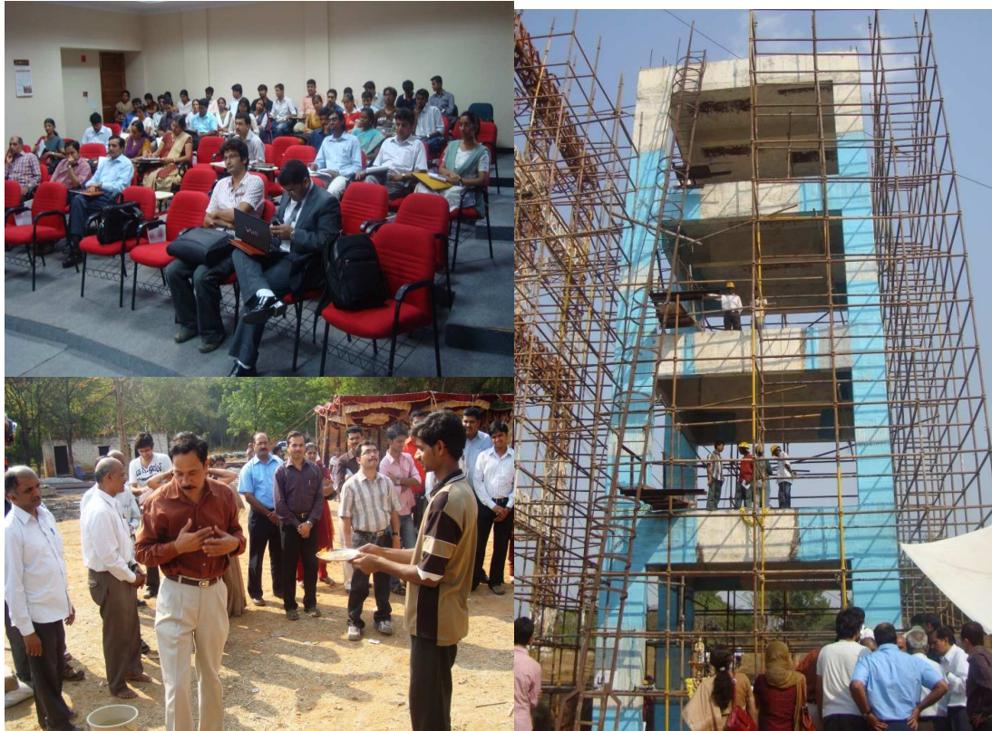
Fig 3 Theme Meeting and Experiment Under Progress

structure was tested till failure. Fig 2 shows the retrofitted structure being tested at CPRI Bangalore. Fig 3 shows the theme meeting in progress and the participants taking part in the experiment.