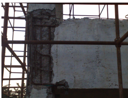
Fig 7 show typical joint failures observed in the structure.