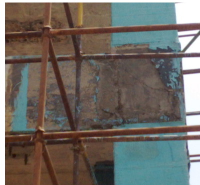
Fig 6 Failure of Beams of as built and retrofitted structure

Fig 7 show typical joint failures observed in the structure.