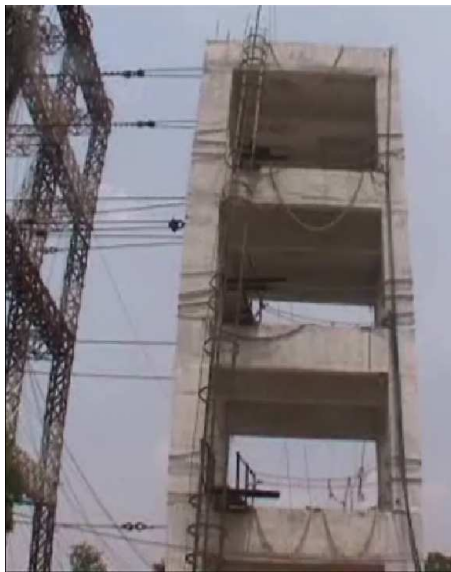
Fig 1 Testing of Original Structure

The theme meeting was followed by the experiment, which was inaugurated by Chairman, Atomic Energy Commission along with Director, BARC and Director-General, CPRI. The structure was tested till failure. Fig 1 shows the structure being tested at the tower testing facility at CPRI Bangalore.