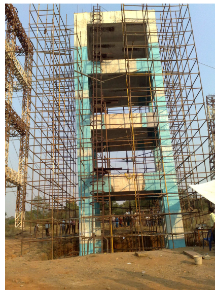
Fig 2 Testing of Retrofitted Structure